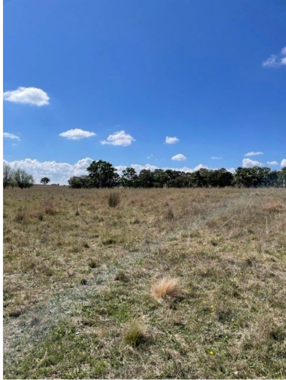
Photograph 5: Example of the grasses encountered throughout the site.