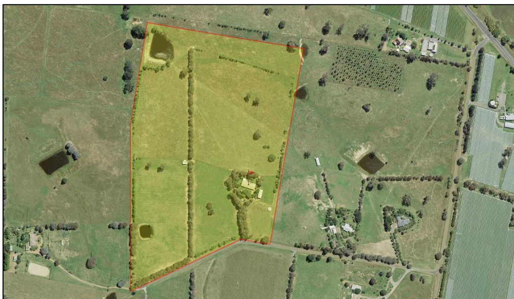
Figure 1: Study area (3 Turton Place, Murrumbateman NSW 2582)

The proposed works involve the construction of a battery energy storage system (BESS) in the northwest of the property. It will occupy approximately 0.5ha, with a driveway to be developed along the eastern boundaries of the western paddocks, as well as an underground and overhead line connecting to the onsite dwelling. As per the development plans provided by the client (Figure 3), the works will require the removal of several trees from along the property's southern boundary, to allow for connection of a driveway to Turton Place.