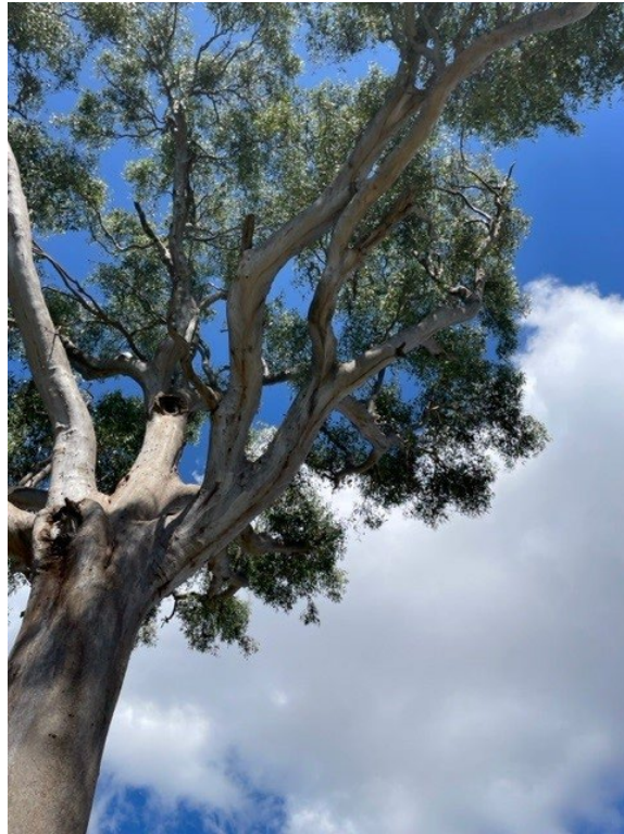
Photograph 7: View of one of the larger eucalypts located in the central northern area of the site, with several hollows identified.