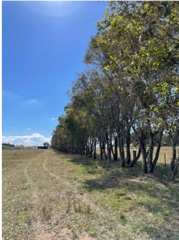
Photograph 1: View facing north along the proposed driveway.