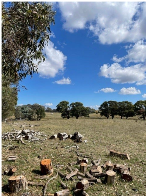
Photograph 2: View facing south towards Turton Place from along the proposed driveway.