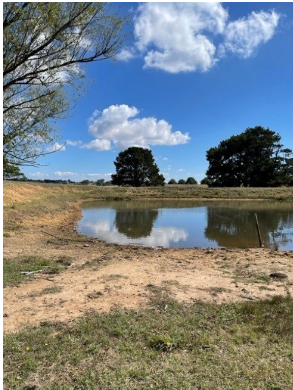
Photograph 6: View of the dam located in the northwest corner of the site.