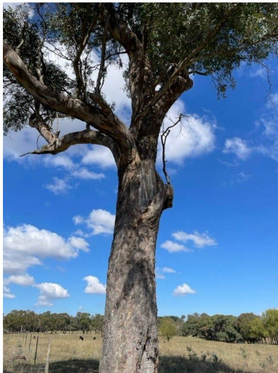
Photograph 4: Closer view of the eucalypt located in the central west of the site, with grassed paddocks present in the background.