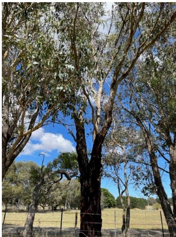
Photograph 10: Example of the younger eucalypts located along the borders of the paddocks.