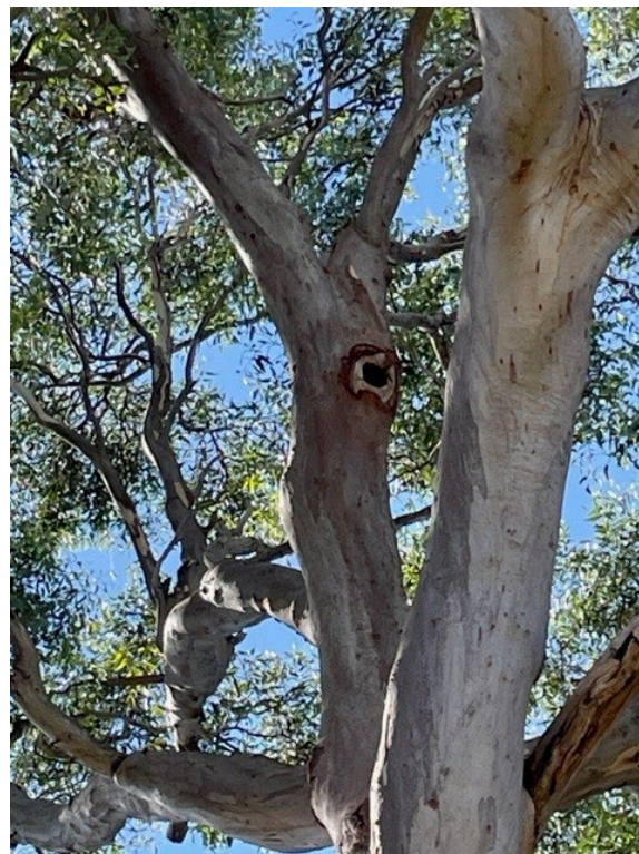
Photograph 8: A hollow identified in one of the larger central northern eucalypts.