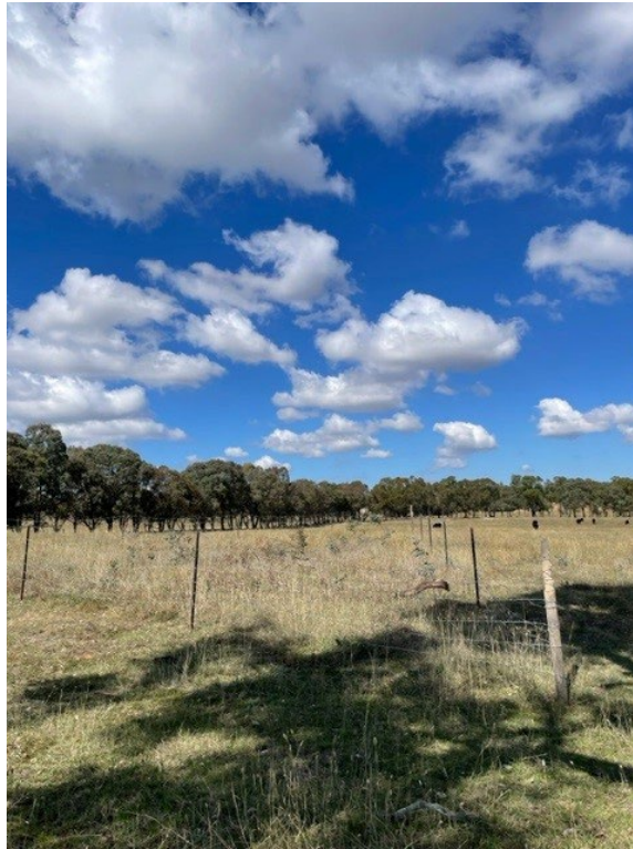
Photograph 9: View of the southwestern paddocks and the vegetation utilised as wind barriers along its border.