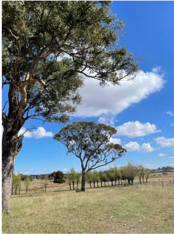
Photograph 3: View of the two larger eucalypt trees in the central west of the site, facing west. These trees will be unaffected by the proposed works.