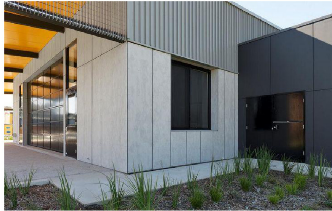
EXAMPLE OF CEMINTEL CLADDING