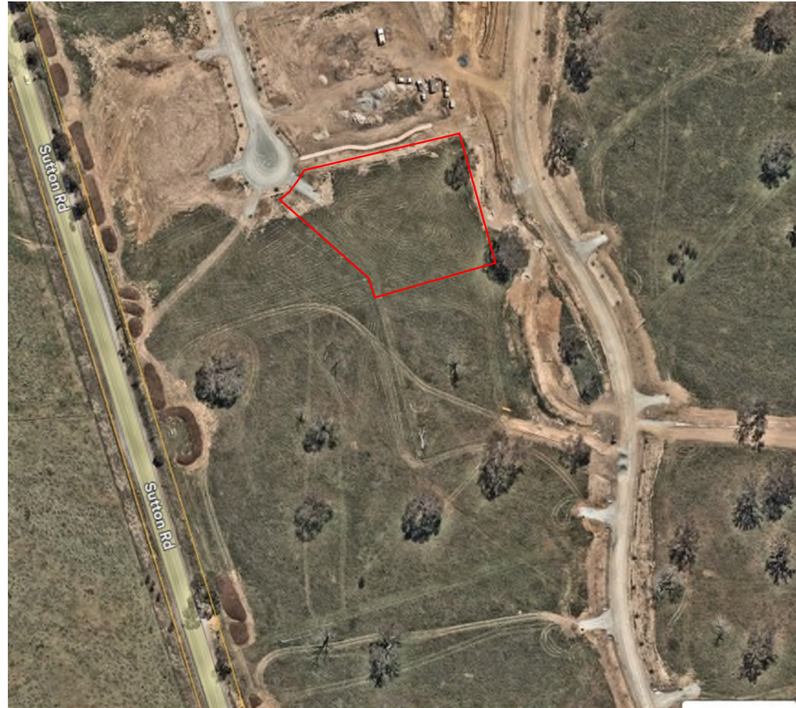
FIGURE 1: SITE LOCALITY