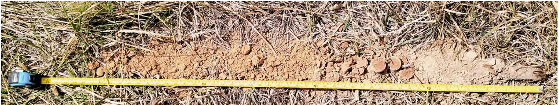
FIGURE 4: SOIL PROFILE AT BH1