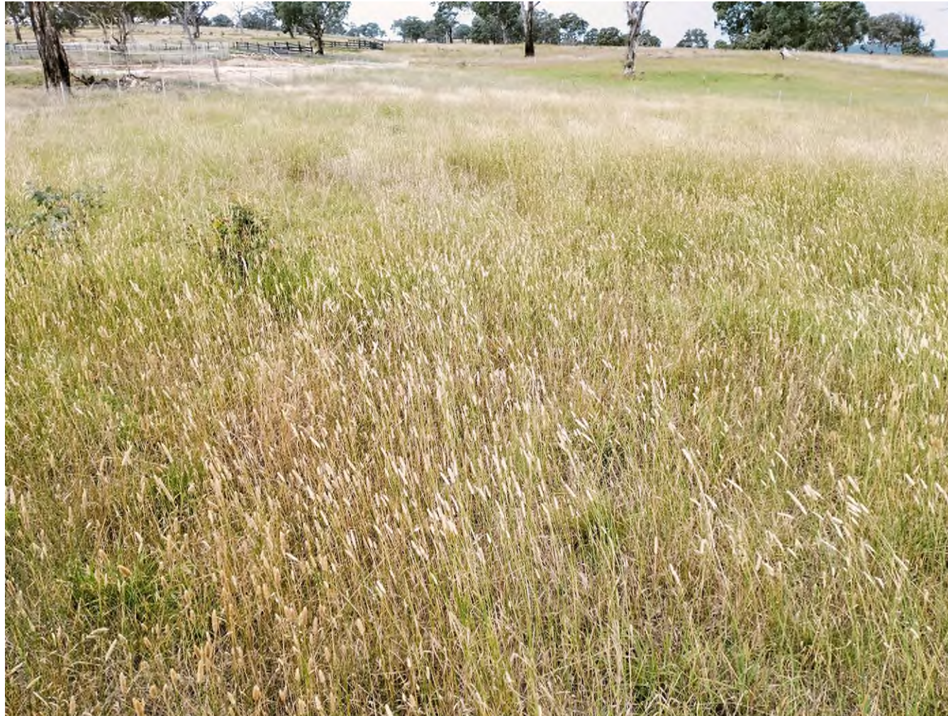
FIGURE 3: SITE PHOTOGRAPH OF THE PROPOSED APPLICATION AREA